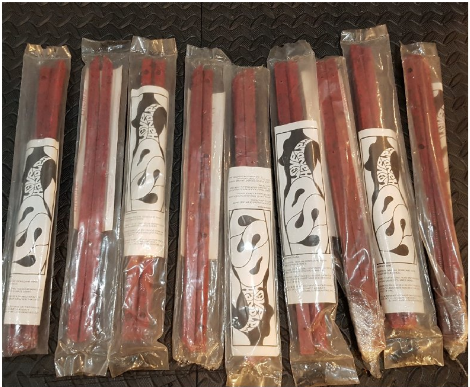
LSD Love Handles Rails